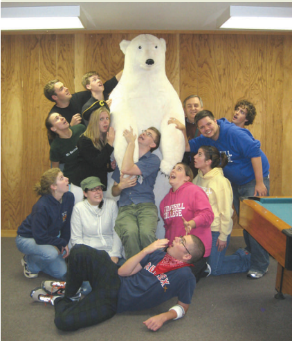
The Team with a Friend

The Encounters Retreat in November proved to be an exciting time. Some of it was planned and some wasn't. We had to stop accepting applications early because we simply ran out of room. The group of 40 retreatants arrived at Camp Burgess on Cape Cod under a beautiful starry sky. The group was full of expectations and energy. They were met by a team of 12 of their peers who had set the stage for their weekend. By Saturday, Mother Nature stepped in and added some excitement of her own. By supper time we had lost power and the wind and rain had come close to hurricane force. We were asked to stay at the main lodge because there was some concern about the cabins. Sure enough a very large tree decided to let go and gently leaned on the roof of one of the cabins. We had to move those students to another building. None of this interfered with the planned activities and left us with memories that will not soon be forgotten. Most of the gang felt that Mother Nature only brought the group closer and added to the excitement of the retreat. By Sunday we were under spectacular blue skies that only happen after a storm. We are looking forward to the next retreat. A reminder to sign up early when the applications become available so that you won't miss this next opportunity.